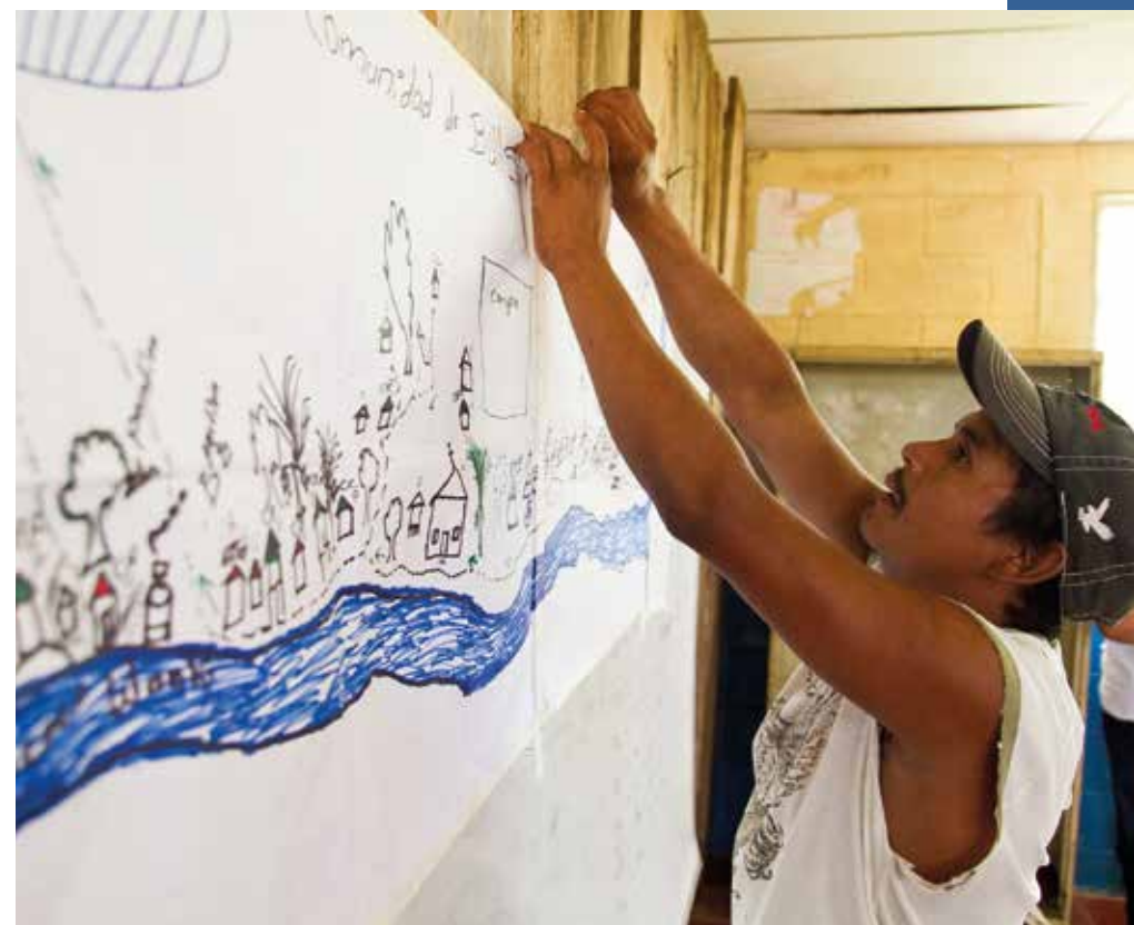
A community maps the risk of a local river overflowing. A simple but effective measure to reduce the risk of disasters.

Hans T. Sy, SM Prime Holdings, Inc. Philippines