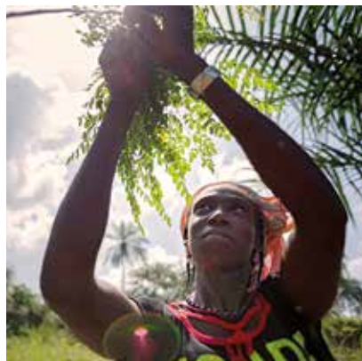
A community resilience building project in Guinea to cultivate Moringa helps to prevent soil erosion.

To find out more about disaster risk reduction and how to get involved please visit: https://www.unisdr.org/we/campaign and www.preventionweb.net