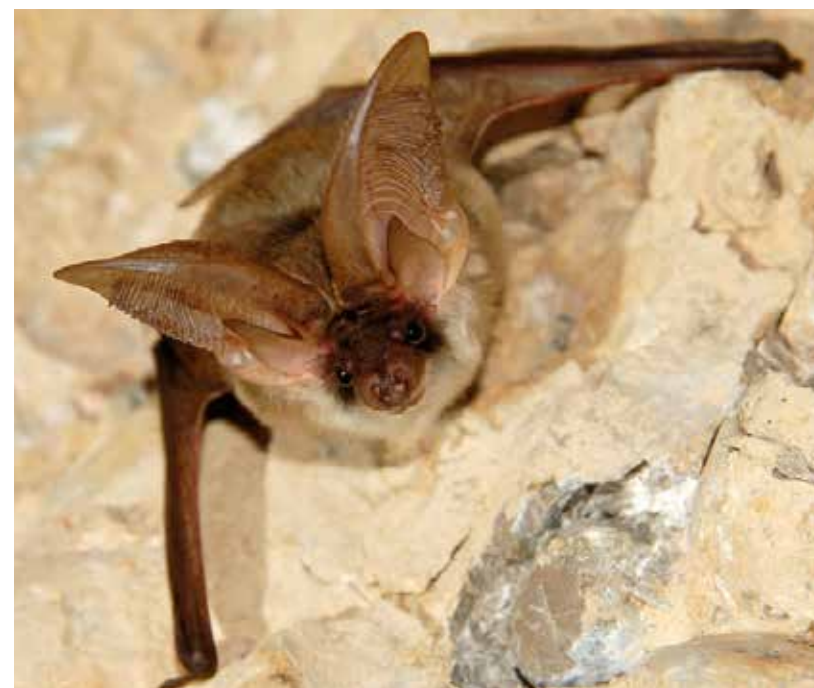
Long Eared Bats live in forests and feed on moths and butterflies they collect from plant surfaces.

"Bats comprise a fifth of the world's mammal species and are essential to healthy environments and human economies globally. Nevertheless, they are in alarming decline." Merlin Tuttle