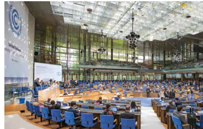
A Conference of the UNFCCC Secretariat in Bonn, Germany.

Leonardo DiCaprio, UN Messenger of Peace