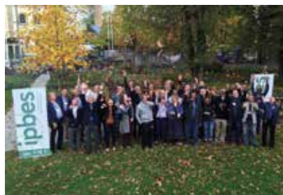
IPBES staff and members of the Bureau and Multidisciplinary Expert Panel.

There is a role for every person at every level through renewed political commitment, greater levels of resources, nomination of experts, contribution of expertise and simple word of mouth advocacy. Register as an IPBES Stakeholder www.ipbes.net/stakeholders