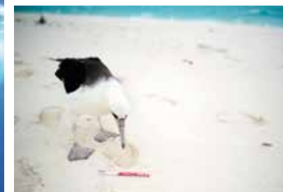
In 2016 the Marine Debris team removed hundreds of toothbrushes from the shorelines of Midway Atoll.