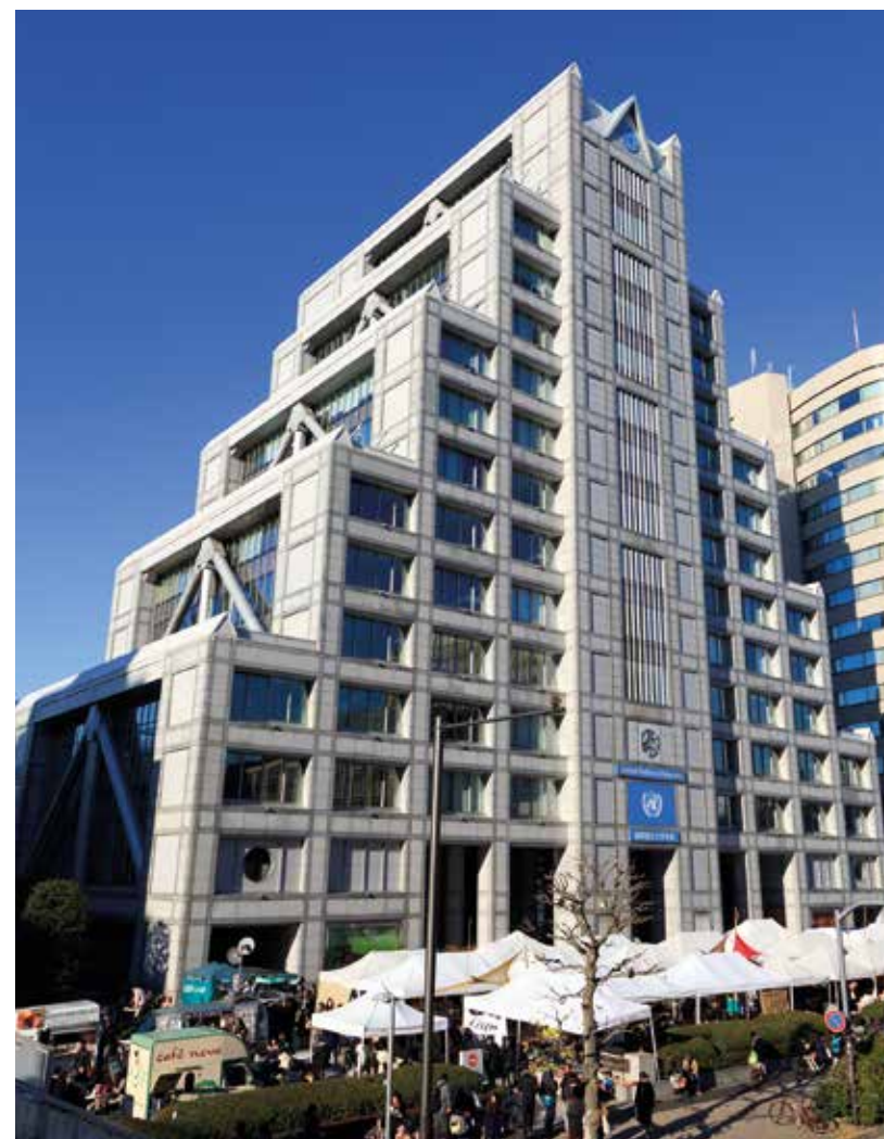
The headquarters of United Nations University are in Tokyo, Japan. Established in 1973, UNU is the academic and research arm of the United Nations.