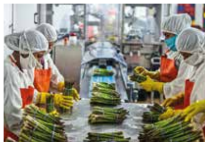
Brokering investment and technology agreements between developed, developing countries and economies in transition.