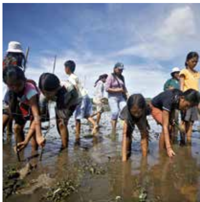
Children participate in a mangrove restoration project in the Philippines, helping to reduce the impact of tsunamis.