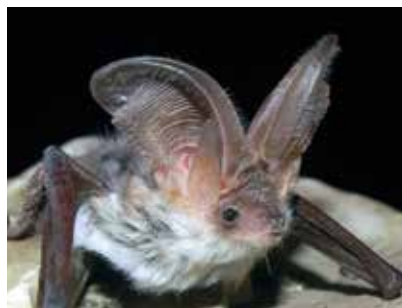
Bats are key predators of nocturnal insects and the need of their conservation was the reason for the establishment of the EUROBATS Agreement.

You can get involved in bat conservation, too! You don't need to be a scientist, you just need to be concerned about bats' problems. If you are interested to learn more about these fascinating flying mammals and to become an active bat conservationist, contact your local, regional or national bat conservation group.