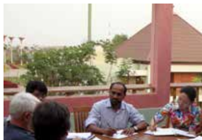
UN-SPIDER Technical Advisory Mission to Myanmar, March 2012.