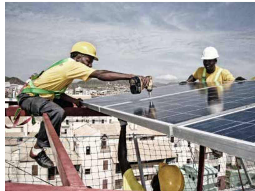
UNIDO ITPO Bonn opens up opportunities for investors and technology suppliers to find potential partners.