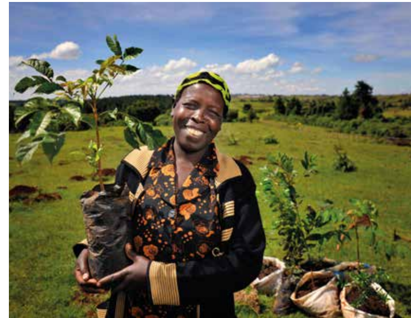
Restoring the soils of degraded ecosystems has the potential to store up to 3 billion tons of carbon annually.

"Old people who are dead since 30 or 40 years would say that this is not their country if they would revive. In the past, this country was very fertile and there were trees everywhere". Head of the Mani Hashem Hima Society, Jordan