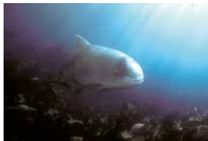
Harbour porpoise.

Current priorities include reducing bycatch and underwater noise, and understanding the impacts of emerging issues such as tidal and wave energy, as well as the cumulative effects on small cetaceans of all the human pressures on the marine environment. In a collaborative manner, ASCOBANS works to develop and agree solutions and mitigation strategies. ASCOBANS supports the SDGs related to the protection of marine ecosystems, but also in terms of education and international collaboration of its Parties.