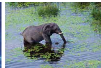
Elephant of the Okavango Delta