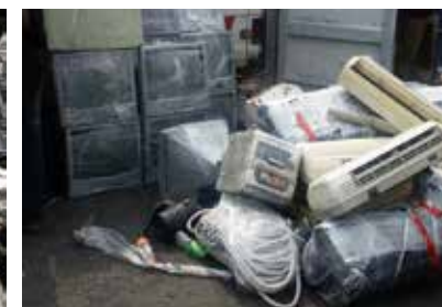
E-waste export to Africa.