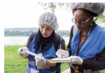
Hazard Simulation Exercise - simulating a flooding of the river Rhine in Bonn, May 2017. Two participants of the Intensive Summer Course „Advancing Disaster Risk Reduction to Enhance Sustainable Development in a Changing World“.