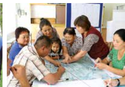
Community members identify exposure areas and critical infrastructure during a participatory mapping activity. Keminsky rayon-Boroldoi, Kyrgyzstan 2016.