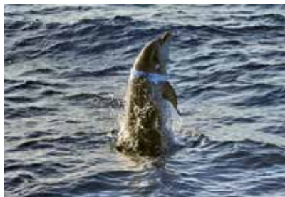
Bottlenose dolphin with litter around its neck.