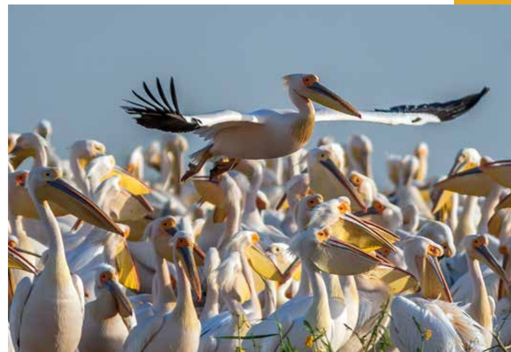
Great White Pelicans are threatened by habitat destruction and collisions with electric powerlines.