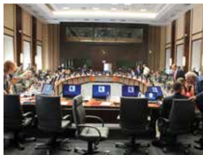
Fruitful conversations among delegates during a break at a Meeting of Parties to the EUROBATS Agreement.

The Agreement on the Conservation of the Populations of European Bats (EUROBATS) was set up in 1991 by range states after recognizing the unfavorable conservation status of bats in Europe, Northern Africa and the Middle East. It aims to protect all 53 species of bats identified in the agreement area, through legislation, education, conservation measures and international co-operation with Agreement members and with countries which have not yet joined.