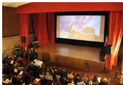
UNRIC's regular film screening Ciné-ONU.