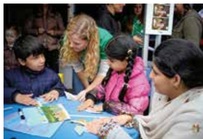
"A better future for everyone", UN Day celebrations.

"We will speak for our rights and we will bring change through our voice. We must believe in the power and the strength of our words. Our words can change the world." Malala Yousafzai, UN Messenger of Peace