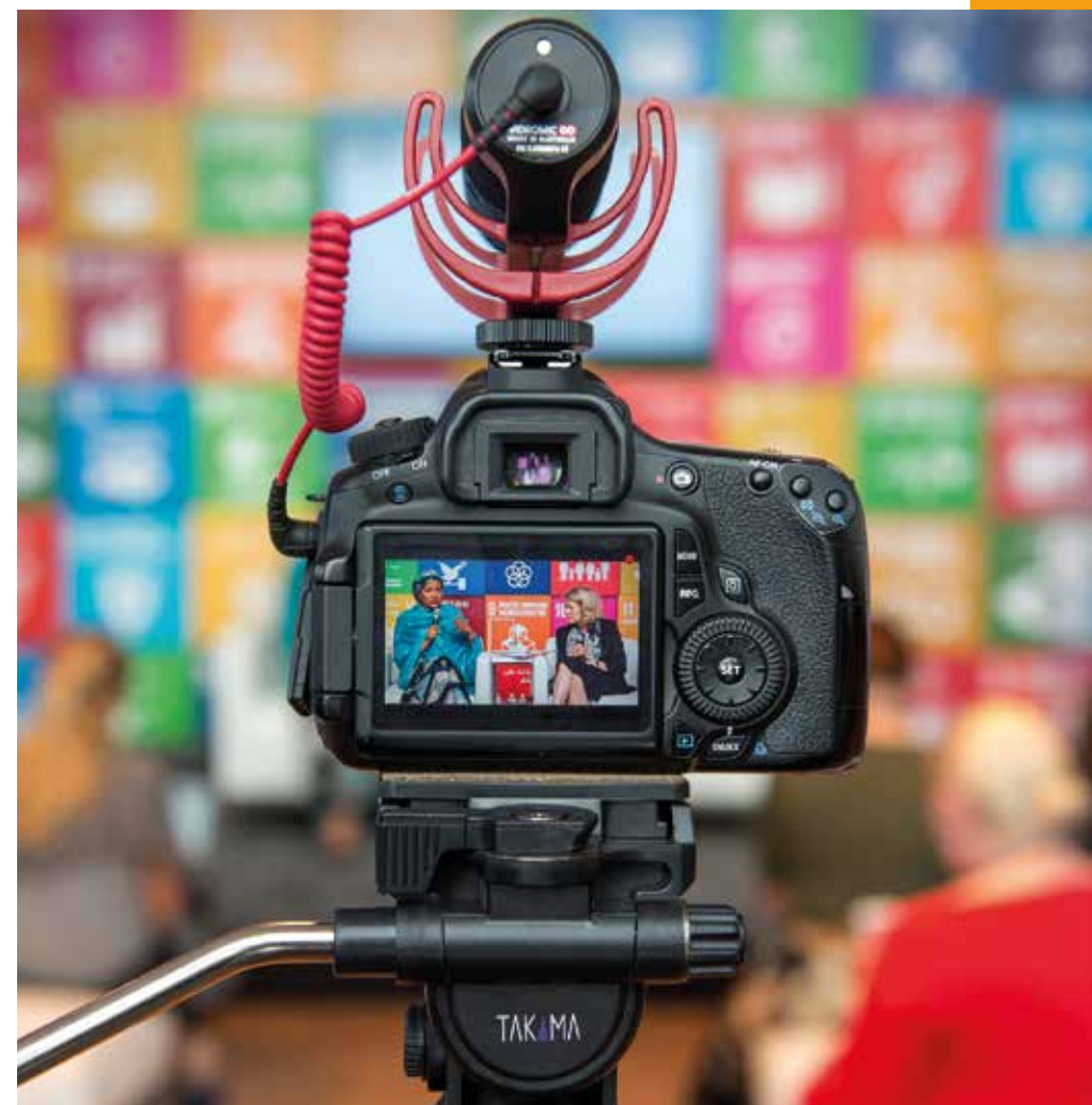
Panel Discussion on the SDGs.