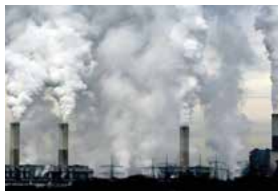
Air pollution is the single largest environmental health risk in Europe.