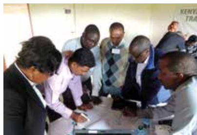
International cooperation to protect migratory waterbirds.

International cooperation across country borders is essential to ensure a favourable conservation status for migratory waterbird populations and to conserve their habitat, which consists mostly of wetlands. The legally binding AEWa Action Plan specifies core actions for contracting parties to warrant the conservation and sustainable use of migratory waterbirds. These include actions for species and habitat conservation and the management of human activities through various means including legal measures, sustainable use or undertaking emergency measures. Research and monitoring, education and awareness-raising, capacity building and sustaining local livelihoods are other aspects addressed under the Agreement. By preserving waterbirds and their habitats, AEWa preserves the wider environment and its natural resources for people.