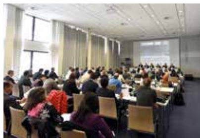
United Nations/Germany International Conference on Earth Observation, May 2015, UN Campus, Bonn.

Through its activities, UN-SPIDER contributes to reducing loss of lives and damage to property and supports the implementation of the 2030 Agenda for Sustainable Development.