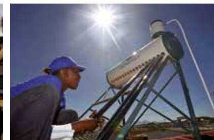
Kuyasa UN Clean Development Mechanism Project, Khayelitsha, South Africa.