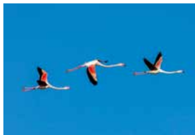
Greater Flamingos are highly gregarious and nest in very few colonies within the flyway.