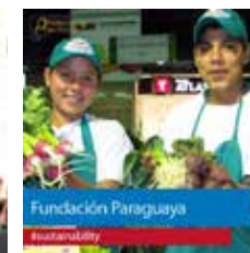
Fundacion Paraguaya, a UNEVOC Centre in Paraguay, not only educates rural and low-income youth, but transforms them into entrepreneurs who can potentially lift themselves and their families out of poverty.

Bringing together key stakeholders from across the world, to foster actionable strategies for TVET to productive employment, lifelong learning and Sustainable Development.