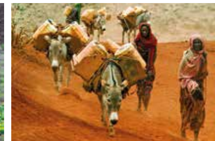
Some 135 million people may be displaced by 2045 as a result of desertification.