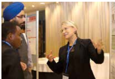
Poster session at a conference organised by UNU-WIDER (World Institute for Development Economics Research) Helsinki, Finland, 2015.

UNU-ViE is committed to ongoing cooperation with other UN agencies, as well as local, regional, national and international stakeholders.