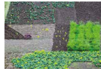
Humans obtain more than 99.7% of their food (calories) from land.