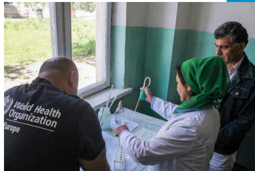
WHO-ECEH supporting capacity building for water quality monitoring in Tajikistan.

Her Royal Highness Crown Princess Mary of Denmark