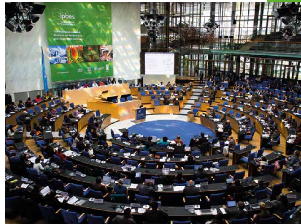
The 5th Session of the Plenary of the Intergovernmental Platform on Biodiversity and Ecosystem Services (IPBES-5) in Bonn, Germany.