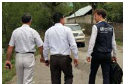
WHO-ECEH staff conducting in-country support work in Central Asia.

These activities are contributing to the development of healthy and safe environments that support resilient and inclusive communities. Our mission is to achieve improved and more equitable health and well-being for all people of the WHO European Region and to contribute to a global environment and health agenda.