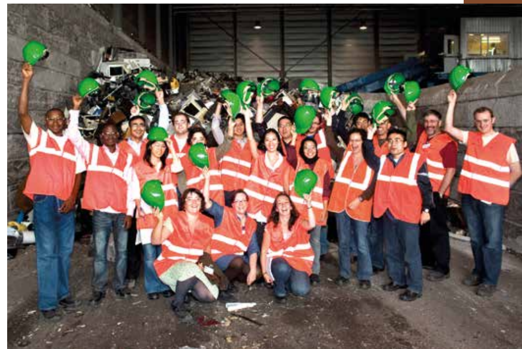
E-waste Academy for Scientists (EWAS) participants visiting a recycling plant.