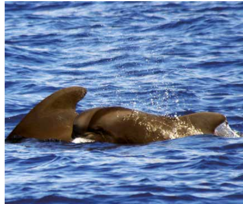
Pilot whales, mother and calf.