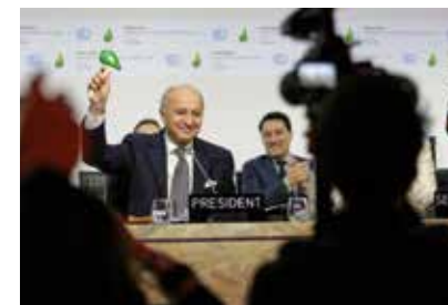
The clinching of the Paris Climate Change Agreement in 2015.