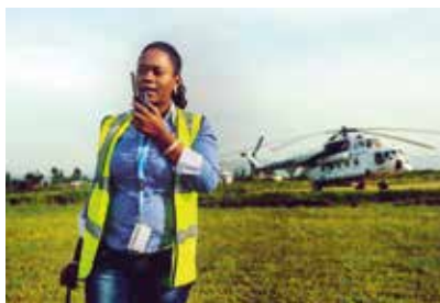
UN Volunteers support United Nations peacekeeping missions with expertise, playing key roles in coordination, logistics and movement control.

Join the volunteering community in support of the UN and sustainable development. To contribute to peace and development in your country, abroad or online: visit www.unv.org/become-volunteer . As a non-profit organization, you can get support from www.onlinevolunteering.org - more than 550,000 volunteers are ready to support you.