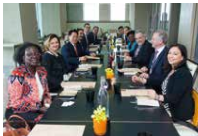
By mobilizing partners and resources to achieve larger development impact, UNIDO drives modern and green industry.

In doing so, investment promotion and the transfer of sustainable technologies have been at the forefront of these efforts, and the Investment and Technology Promotion Office in Bonn participates in this endeavor by fostering mutually beneficiary industrial cooperation between enterprises in Germany and in developing countries.